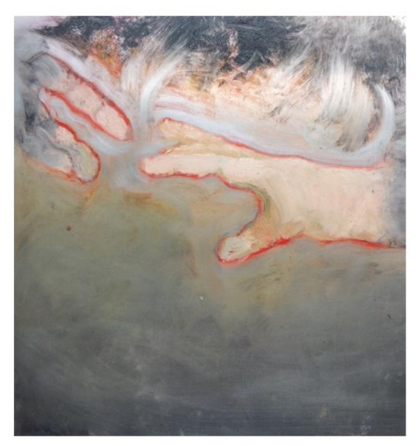
29. SUE CHALLIS -Care without Borders 1

The exhibition provides a rich, and moving, visual experience to those not so busy they can stop and look. Looking closely reveals imaginative responses to the International Nurse Day theme: 'Health for All'.