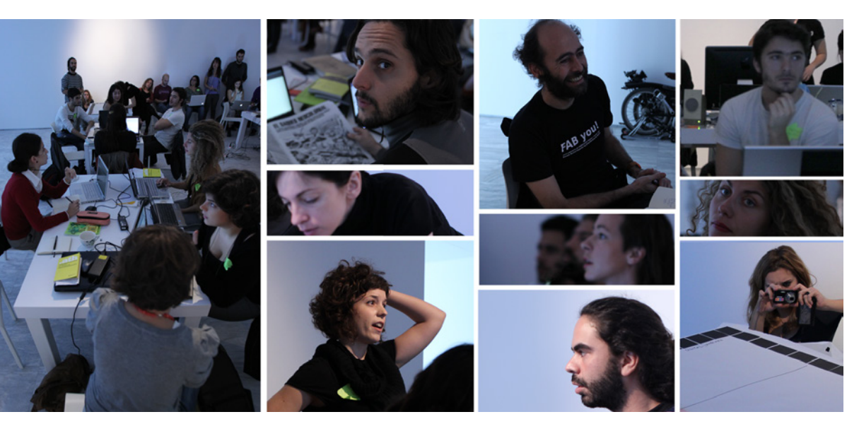
Figure 2. Mapping the Commons, Athens , Hackitectura, 2010. Snapshots from the workshop at the National Museum of Contemporary Art, Athens. Photographer: Demitri Delinikolas. Used with permission via the Creative Commons Attribution Non-Commercial-Sharealine 4.0 International license.

versity. Theorists, activists and artists with a special interest in the field of the commons were also involved. The scope of the workshop for this interdisciplinary team was influenced by the Italian school of thought and, especially, by the analysis of Michael Hardt and Antonio Negri about the relationship of the commons with the contemporary metropolis. Considering the city as "the source of the common and the recectable into which it flows," a cartography of the commons for the city of Athens was attempted in order to highlight the city's living dynamic and its possibility for change. Participants were therefore invited to turn to multitude's affects, languages, social relationships, knowledge and interests in order to understand, locate and emphasize commons, which to a great extent were immaterial and abundant, fluid and unstable.