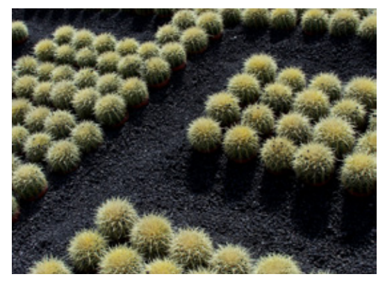
Detail from 204_NO_CONTENT, 2007, Darko Fritz

Through those actions of decontextualization of system messages, Fritz erases the illusion of their functionality; he turns them into what they actually are - ornamental screens whose purpose is to