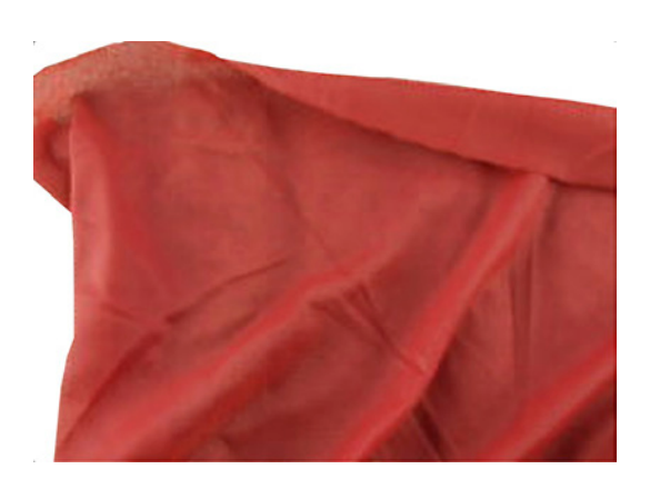
Figure 3. Red Flag, Original, GDR, Elske Rosenfeld, 2011. Photo Series. © Elske Rosenfeld, 2011. Used with permission.

E: Yes, and this is, once again, a very clear and immediate political impulse to doing what I do. In response to this conversation in Canada, I started looking on eBay and researching for East German produced red flags and made a series of prints of those images, exactly as they were posted on eBay, with a small text plate next to them that states where and when they were purchased, alongside the name of the East German factory where they were produced.