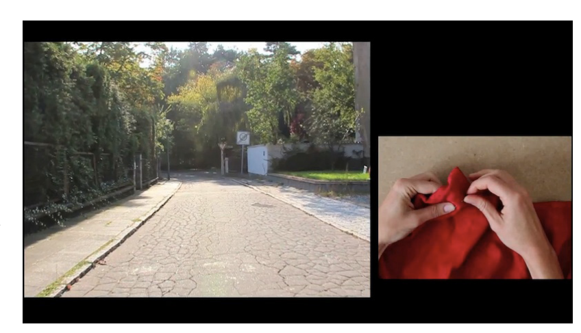
Figure 4. Pankow Colourtest (Die Rote Fahne, III), Elske Rosenfeld, 2011. Video installation or 2-channel video, HDV, color, 14 minutes. © Elske Rosenfeld, 2011. Used with permission.

My next project after these two was the video Je ne rentrerai pas , which goes back to my research on 1989 and revolution, and the question of what other