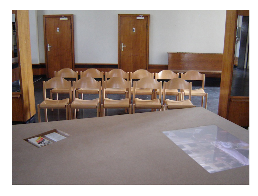
Figure 1. May I Interrupt, Elske Rosenfeld, 2009. Video Installation. Original footage courtesy of Robert-Havemann-Archiv, Berlin. © Elske Rosenfeld, 2009. Used with permission.

sorts of interesting issues to do with what happens when revolution starts to self-institutionalize. And this was the moment that I was interested in, to see what happens when revolution tries to install itself as permanent change, as institution.