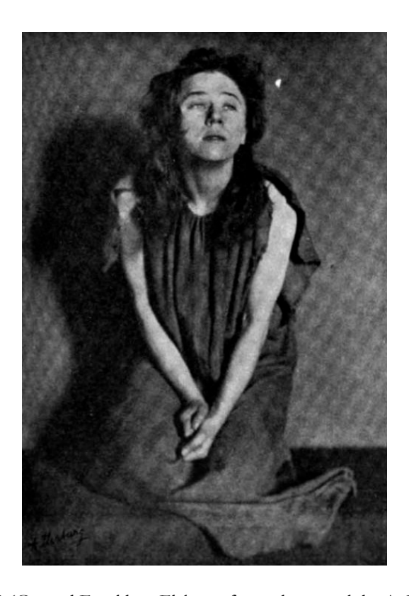
Figure 7. 'Gertrud Eysoldt as Elektra, after a photograph by A. Hartwig'. Source: Rudolph Lothar, Das deutsche Drama der Gegenwart (Munich: Müller, 1905), p. 225.

staged feminist interventions in socio-cultural constructions of female subjectivity'. 70 In her use of stylized, exaggerated, and even grotesque gestures - movements encouraged by the style and content of Decadent and Symbolist dramas - Eysoldt expresses the psychological suffering of her characters in a profoundly avant-garde way [see Fig. 7]. Her work brings to life the same anguish captured by the twisted figures of Expressionist painters like Oskar Kokoschka or Egon Schiele.71