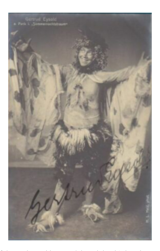
Figure 5. Portrait of Gertrud Eysoldt as Puck in Reinhardt's hugely successful production of A Midsummer Night's Dream.