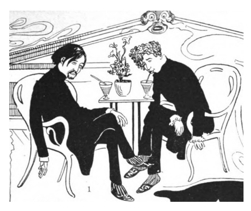
Figure 2. C. Hall, 'Aus Schall und Rauch: Die Dekadenten'