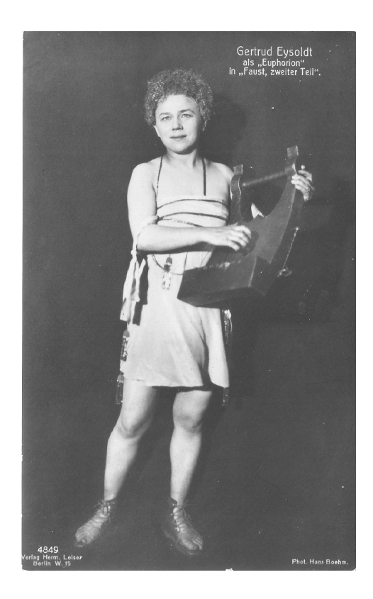
Figure 6. Postcard of Eysoldt as Goethe's Euphorion, ca. 1911, photographed by Hans Böhm. Source: author's own collection.