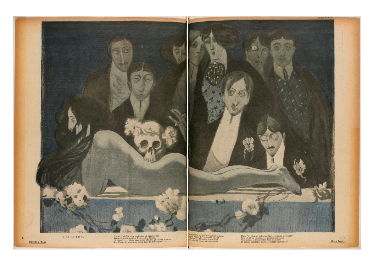
Figure 3. Manuel Orazi, 'Messes noires', in L'Assiette au beurre, 141 (12 December 1903).

by Le Journal collaborator Arthur Dupin that during his military service Adelswärd-Fersen attempted to re-enact a scene of Satanic nude debauchery from Lorrain's Les Noronsoff. Entitled 'Le souper de Trimalcion', as a reference to Petronius' Satyricon, at a dinner party the hero unveils the naked bodies of three men placed on the dining table [see Fig. 3].