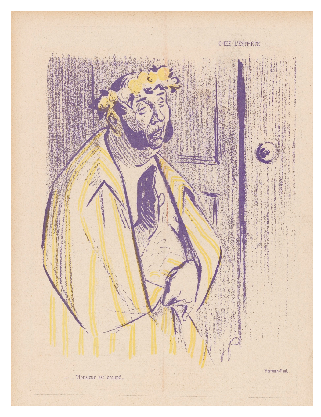
Figure 1. René Georges Hermann-Paul, 'Chez l'esthète', in Le Canard Sauvage, 19 (26 July-1 August 1903). The caption reads: 'Monsieur est occupé...' [Monsieur is busy...]

decadent aesthetics, be they textual or visual in (often satirical) magazines [see Fig. 1], for it quickly became clear that the 'Black Masses' scandal did not involve any actual black masses or further Satanic practices.