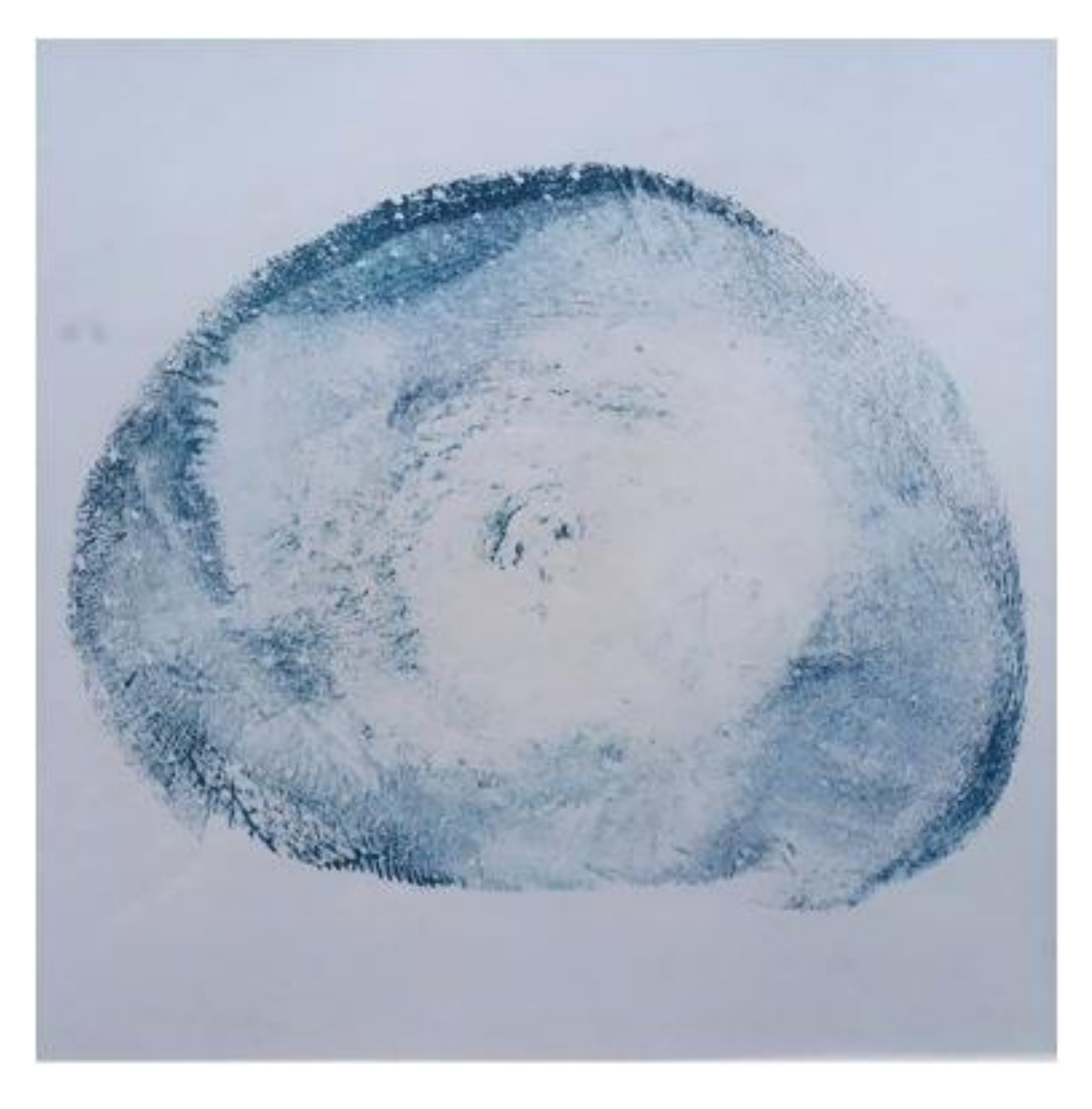
Figure 7. My Right Breast. 2015.

This image came into being after the birth of my daughter. I had always planned to breastfeed, however was unaware of the pressures and strong opinions had by professionals and new mothers about what was the 'right' thing to do. When thinking about Winnicott's ideas, I realised that they are present not only within my work but also in my day to day life and relationship with my daughter, especially regarding his concepts of a 'good enough mother' and 'transitional object'.