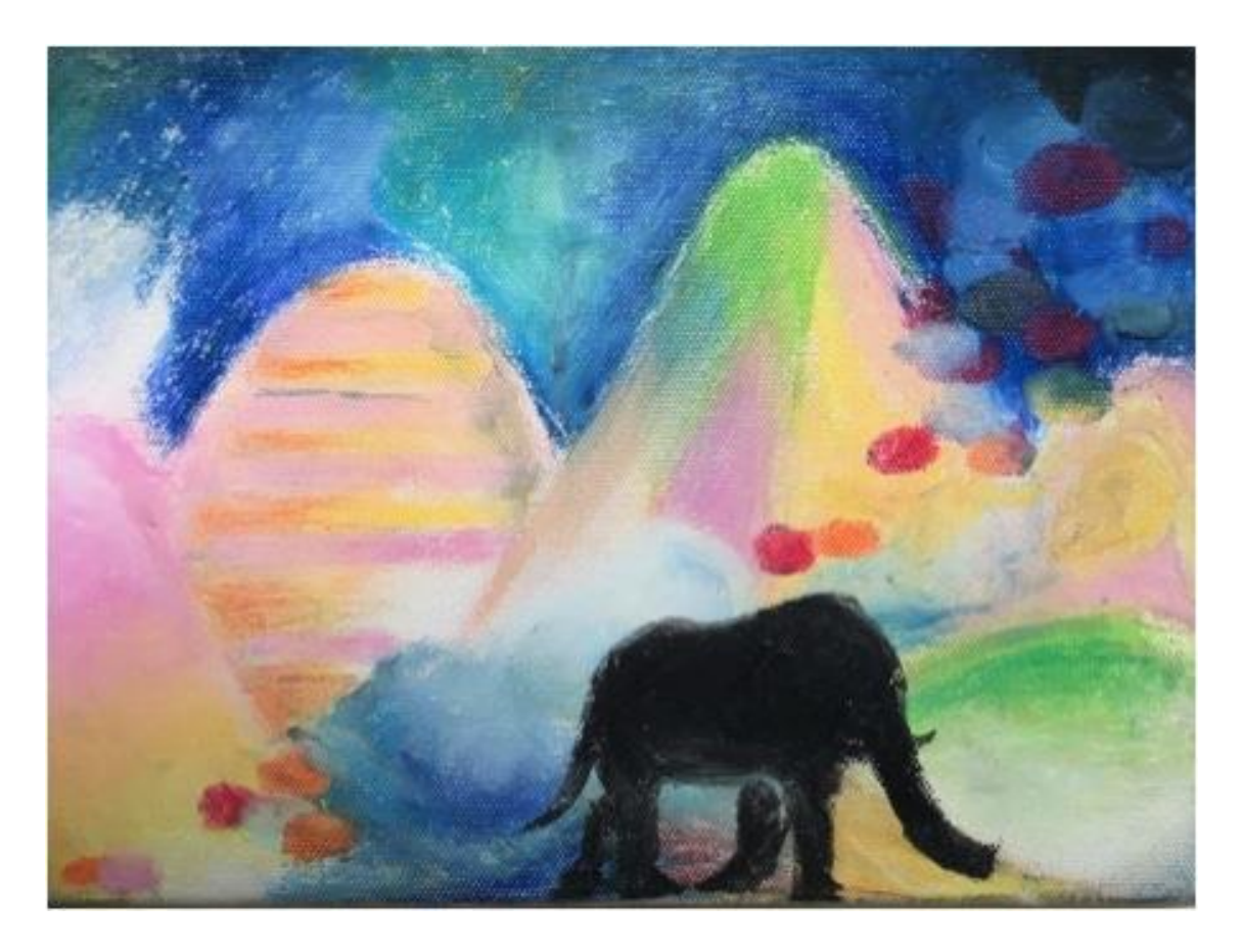
Figure 10. Elephant Walking Through Mountain Valley, Slowly but Steady. 2014.