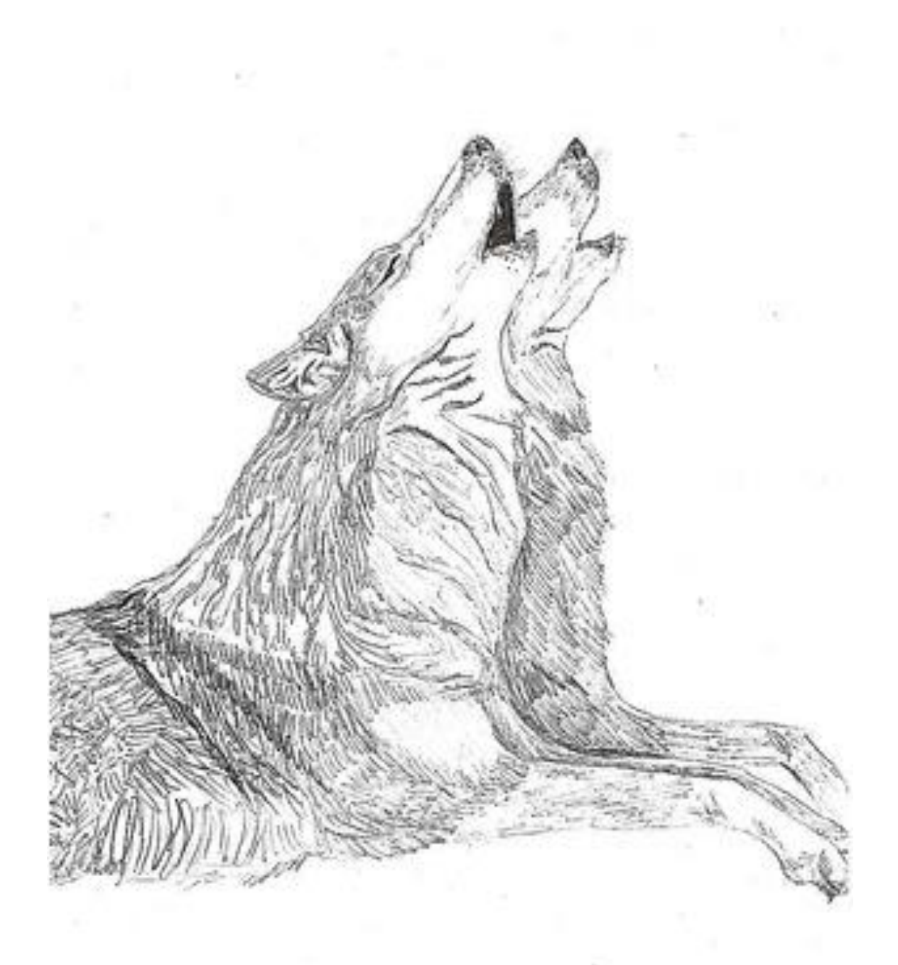
Figure 9. Wolf Music. 2017.

I think Winnicott's idea of the mirror role of mother and family is one of the most significant aspects of being an art psychotherapist and artist for me, enabling a sense of being truly seen and a deep feeling of acceptance. The artwork can act as a mirror and grasp something, reflecting it back more fully