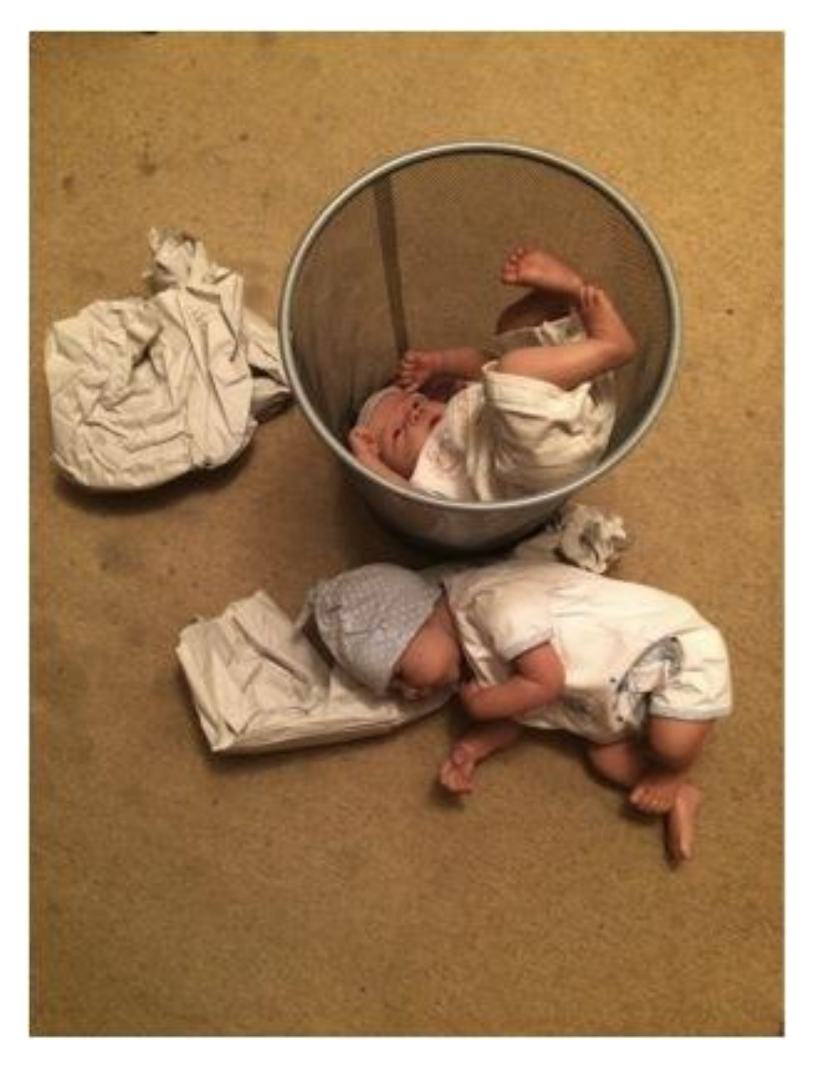
Figure 3. Are You Sitting Comfortably? 2017.

Working to develop therapeutic alliances with people living inside forensic mental health services, I turn to Winnicott's concept of the 'Good Enough Mother'. I reflect on his work as I enter landscapes of devastation and