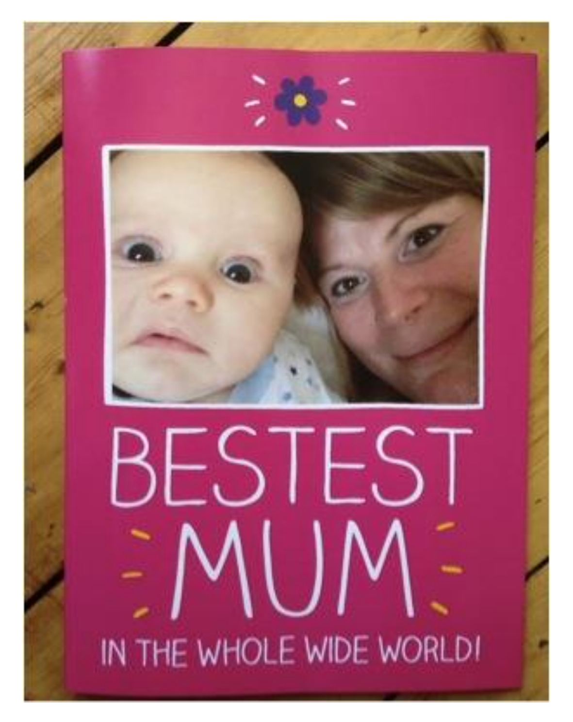
Figure 8. Mother's day card. 2017.

As a therapist and having just become a mother I am thinking a lot about Winnicott's holding environment to be a 'good enough mother' to my baby. This mother's day card plays with the idea of an idealized mother.