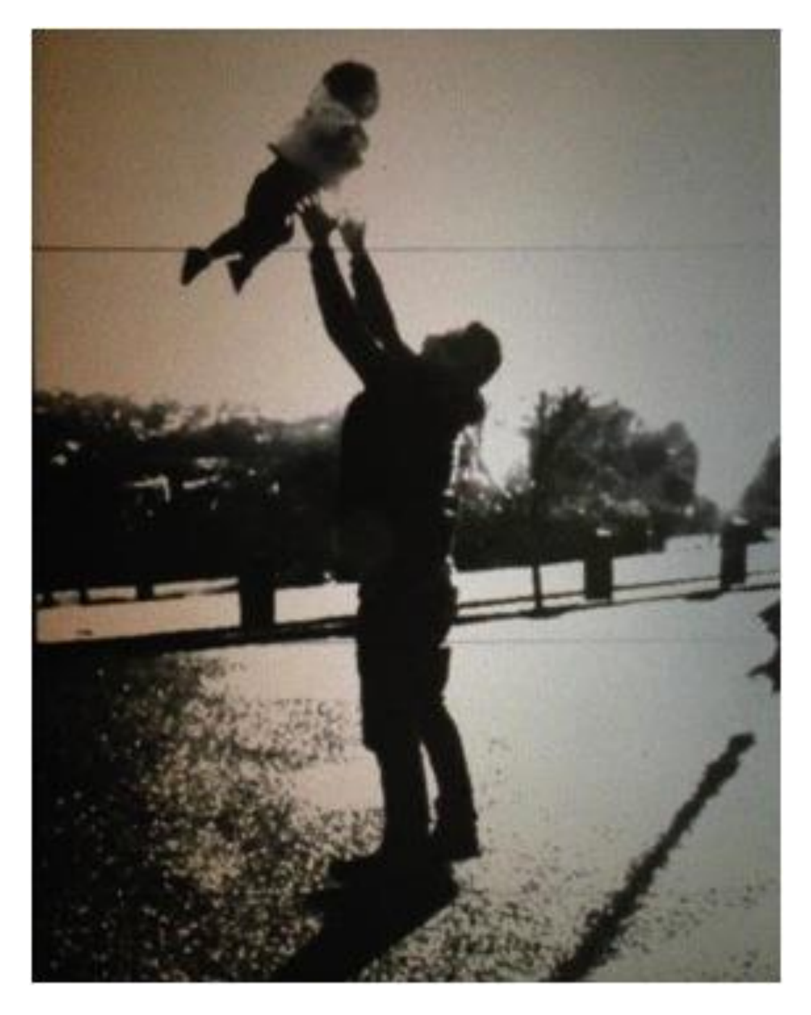
Figure 1. Saudade. 2014.