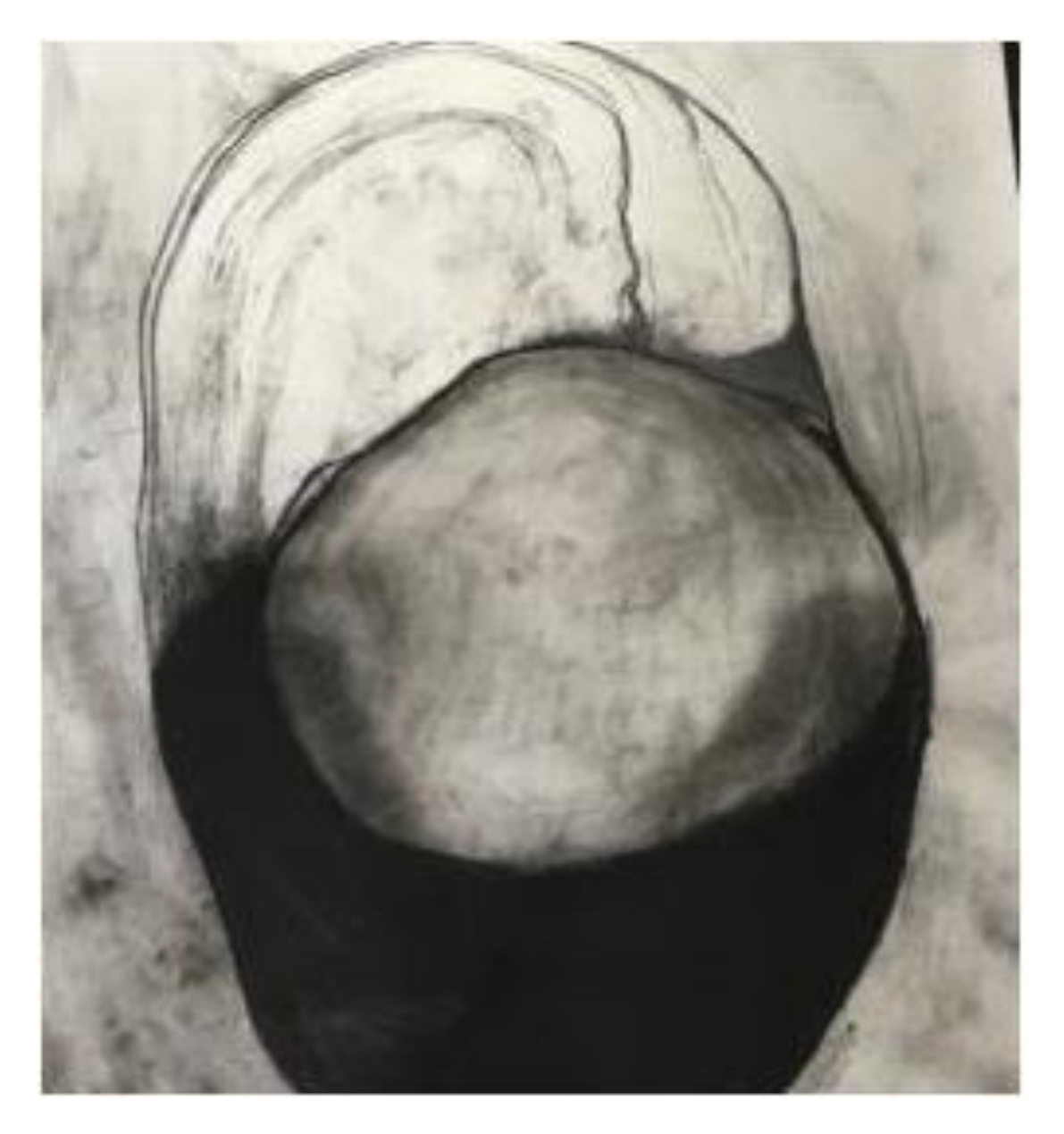
Figure 5. Untitled. 2017.

The work and writing of Winnicott and my involvement in Winnicott Wednesdays play an important part in my development as an art therapist and artist. Being an artist for me is in essence allowing myself to play, create,