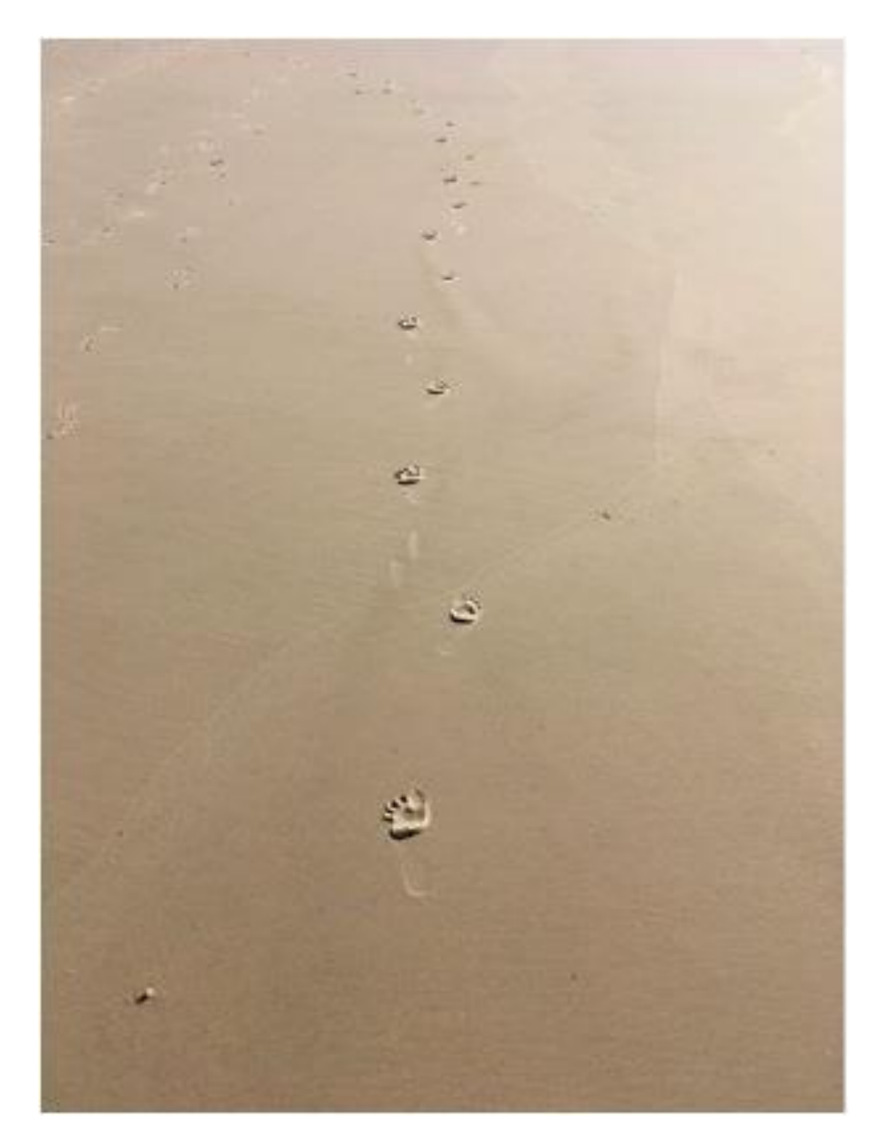
Figure 2. There I am, running away. 2017.