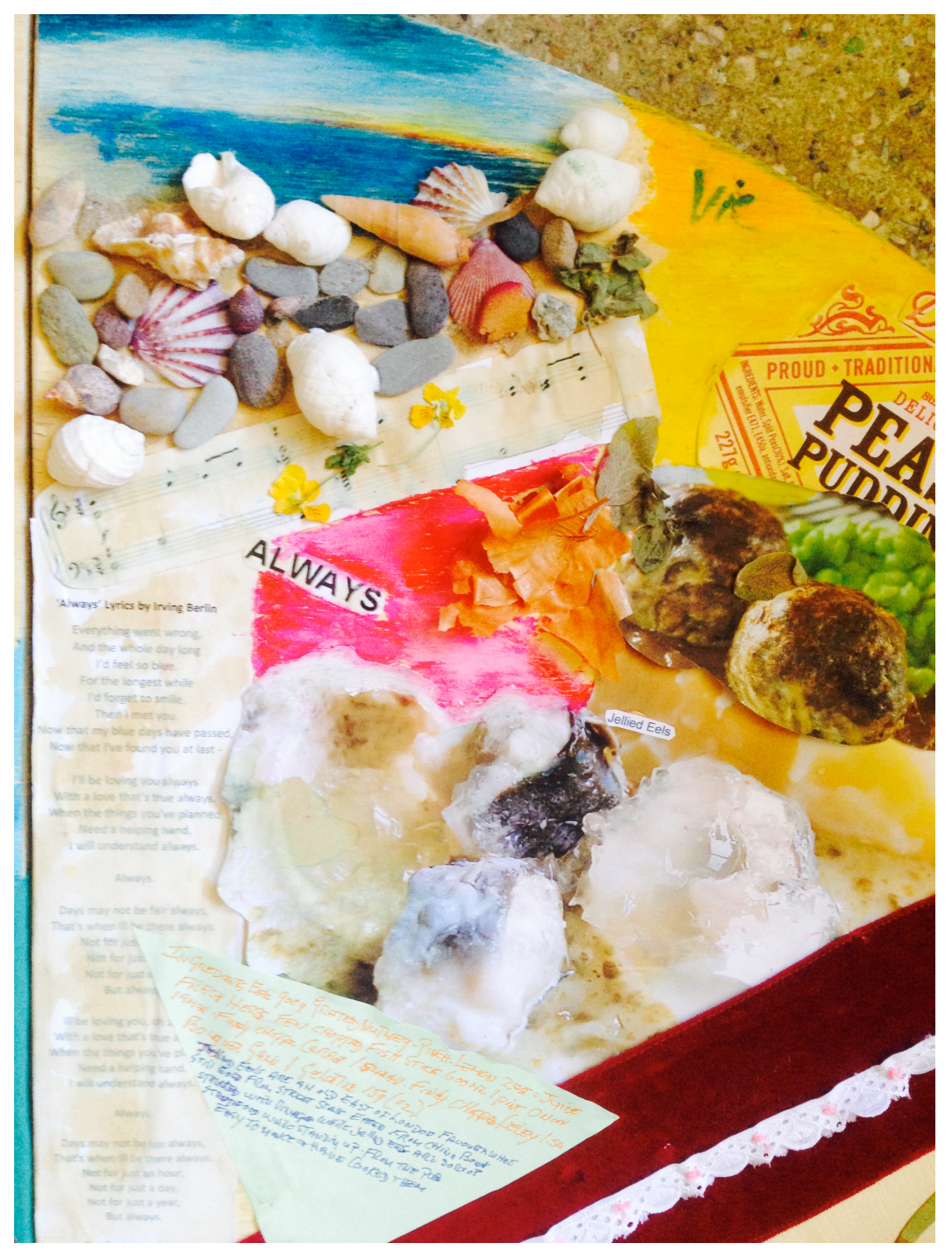
Figure 2: Detail of Daisy's collage