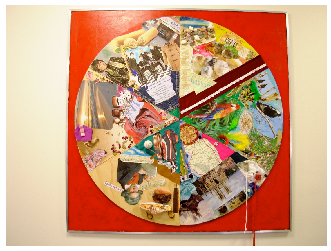
Figure 3: Complete group mandala collage

When all six met as a group, each positioning or directing their piece to be linked together in unison, their astonishment at the size, colour and sensual materiality was audible. Two gentlemen joyfully shared stories of golf and football, and all were amazed they had achieved this large piece of art that mirrored their lives. The finishing off as a group involved selecting a colour for the square base, they had strong views, it was to be either black or red. Red won the day as red is Daisy's favourite colour. Together they painted red with thick opaque acrylic, whilst listening to their selection of musical recordings; one gentleman gently dozing as his paintbrush rested on the surface. When it was all done, Daisy startled everyone by saying she was going to attach two precious pebbles from the very beach of her childhood onto her sea-side scene. She told the others that she had kept these two pebbles all her life. There were silent gasps as she forcefully squeezed the craft glue onto her beach and pushed the pebbles in (see fig 4). This act was lost on no-one.