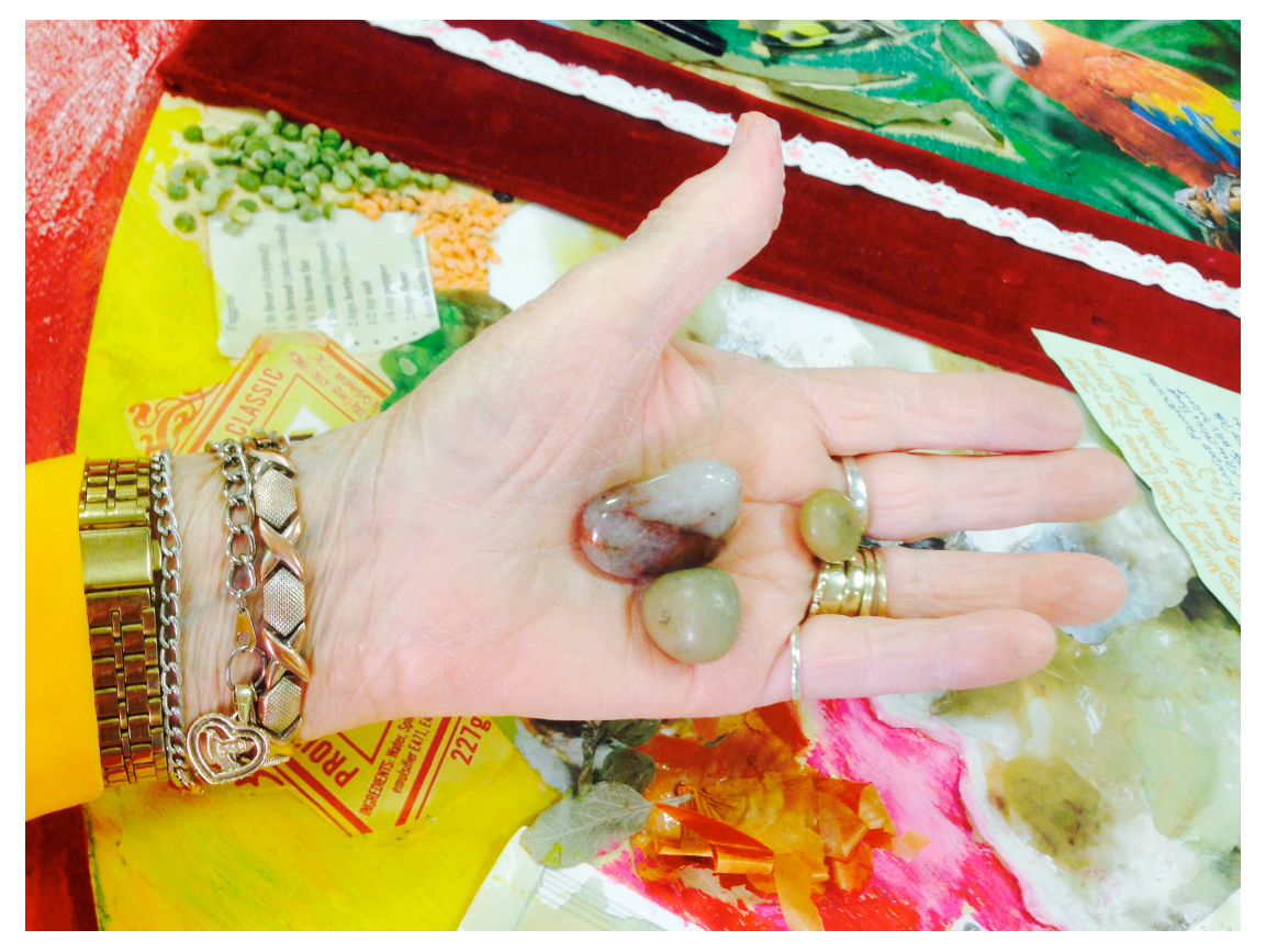
Figure 4: Daisy's hand with pebbles

Daisy had given something away but also acquired a dimension previously out of reach. She was no longer anxious and revealed a new restfulness as she was now able to gaze on her piece of the mandala which, when touched could spin around (on a lazy Susan swivel joint) and be either on the top, side or bottom for different views and insights. An illustrated booklet with excerpts of participant dialogue and processing lay on a table beside a comments box. Daisy's daughter wrote a letter for the comments box, saying that every time she looked at the mandala, she saw something new in her mother's life.