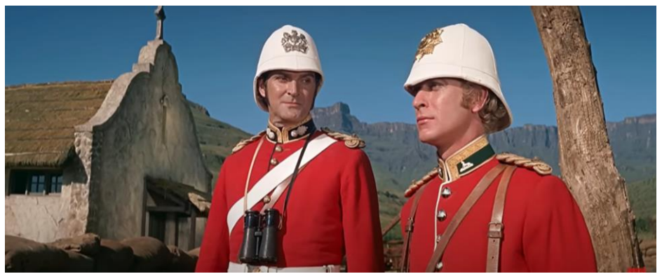
Figure 3: Lieutenants Chard (Stanley Baker) and Bromhead (Michael Caine). Zulu (1964) dir. Cy Endfield, Diamond Films / Paramount Pictures.

The film's main characters are two British officers, Lieutenant Chard (Stanley Baker) and Lieutenant Bromhead (Michael Caine) (Figure 3). They are responsible for organising the defensive action which occupies the bulk of the narrative. Throughout the film we are shown how the officers take control of a dangerous and rapidly developing situation through ingenuity, tactical proficiency, and the ability to remain calm and display decisive and pragmatic behaviour under highly stressful conditions. Eventually, after surviving waves of attacks by Zulu warriors through the virtues of individual bravery, comradeship, and a firm commitment to a malleable yet distinctly hierarchical command structure, the British forces at Rorke's Drift win the day. In the final scene, the remaining African warriors depart the field with a gesture of respect for their adversaries.