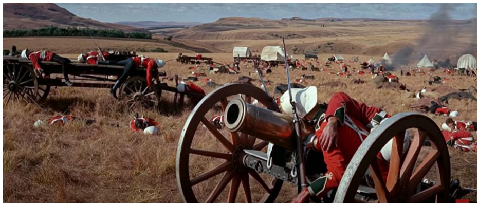
Figure 6: The aftermath of the British defeat at Isandhlwana. Zulu (1964) dir. Cy Endfield, Diamond Films / Paramount Pictures.

satisfactorily explained; nor has his failure to return with reinforcements. There is, in any case, no excuse for an officer abandoning his post when an attack is imminent'.<sup>33</sup> The shocking defeat of British forces at Isandhlwana – the event which sets the stakes for the drama at Rorke's Drift during the opening scene of Zulu (Figure 6) – was attributed, in part, to poor organisation of defences by the commanding officers, through a general 'failure to take precautionary measures at the camp [...] No lookout was established on the top of Isandhlwana itself, and no pickets were posted to the west of the hill. In other words, the rear of the camp was quite unprovided for'.<sup>34</sup>