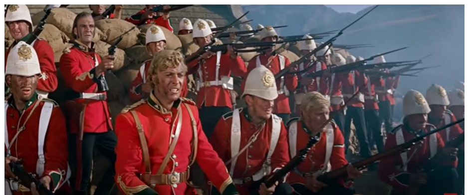
Figure I: Lieutenants Bromhead (Michael Caine) and Chard (Stanley Baker) and the defenders of Rorke's Drift. Zulu (1964) dir. Cy Endfield, Diamond Films / Paramount Pictures.

the nineteenth century, when a mythic class system was seen to provide a necessary and vital structure in social life.<sup>3</sup> In addition, qualities of military leadership often overlap with a civilian paradigm of entrepreneurial practice, as described by various economic sociologists.<sup>4</sup> Cultural texts will often present audiences with military figures, therefore, whose personal qualities of individual authority – proven, more often than not, in the heat of battle – are shown to be capable of integrating unproblematically into the capitalist economy and its supporting metaphysics of value. It is important, therefore, to look at cultural representations which contextualise leadership in reference to frameworks shared between military and corporate social systems and consider how this relationship is illuminated by the text's wider historical construction and reception.