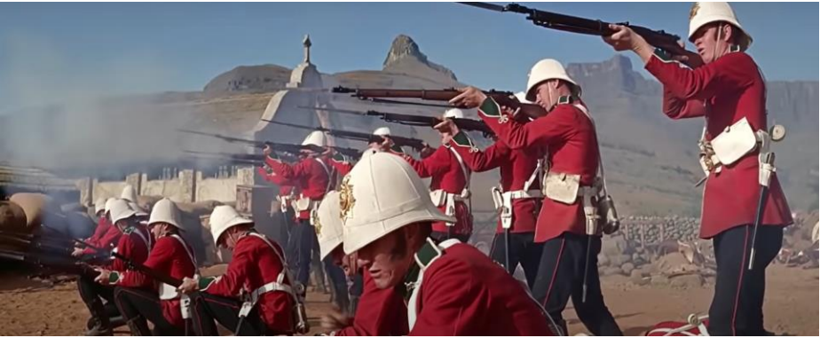
Figure 5: Riflemen in a classical volley fire military formation repelling the Zulu breach of the outer walls. Zulu (1964) dir. Cy Endfield, Diamond Films / Paramount Pictures.

the affective 'solution' to a dangerous 'problem'. At such moments, the film seems to fetishise military action as the creation of a semi-human killing machine which symbolises more than British imperial power, but also an abstract conception of effective organised performance. It is also possible to critique such spectacles of violence in terms of capitalist metaphysics itself, or through the sublime merging of quantity and quality. What comes to the foreground in this moment is the underlying idea that the success or failure of the battle – the triumph of the positively valued diegetic elements – depends upon the immediate and formalised process of killing as many enemies as possible. If the audience experiences 'goosebumps' during this scene, as many viewers seem to, then it is a curious moment of conflation between the embodied pleasures of audio-visual spectatorship and the mythologisation of the doctrine of purposeful activity – an audio-visual paean to human agency, impactful cause and effect, which has, as its disavowed 'explanan', a naturalised and commonsensical conception of leadership and social organisation.<sup>31</sup>