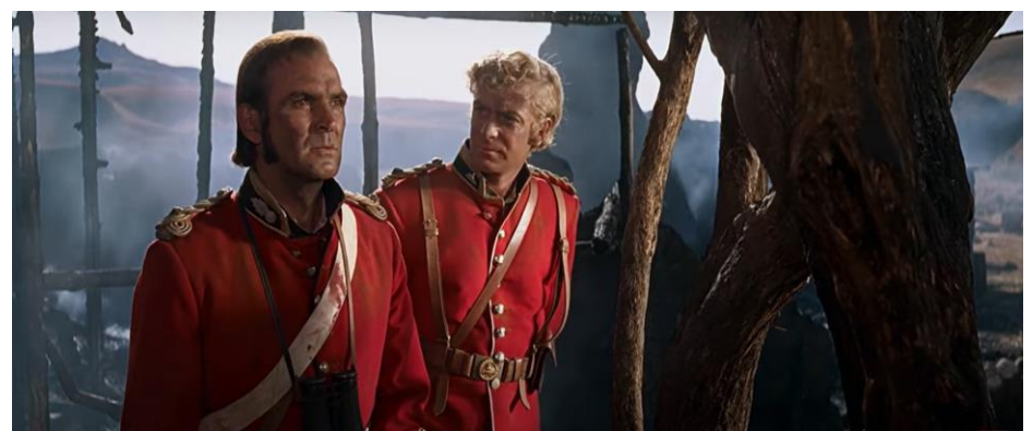
Figure 4: The 'professional' Chard leading Bromhead following the battle. Zulu (1964) dir. Cy Endfield, Diamond Films / Paramount Pictures.

According to this interpretation, Chard's ability to take command and successfully lead his men in the defence of Rorke's Drift (Figure 4) exemplifies the capacity of a new professional class to take the reins of leadership in a modern microcosm of British society. Throughout the film, the officers call on their sergeants to carry out orders. Audiences are encouraged to understand the need for an efficient and unimpeded chain-of-command by witnessing the successful execution of military strategy by the NCOs. Corporal Allen (Glynn Edwards) and Colour-Sergeant Bourne (Nigel Green) are emblematic figures of British working-class heroism. Their stalwart, straightbacked hardiness, emphasised through physical stature and air of paternal authority, are role models for the ordinary privates. Chard and Bromhead know they can rely on their NCOs to maintain morale and an effective chain-of-command. The image of traditional hierarchical class placement becomes a form of comfort which is intimately connected to the audiences' empathic desire to see the sympathetic British characters survive the battle. Again, the ideology of leadership ascribes ultimate value to those who stand at the top of the hierarchy, but also credits those leaders with the ability to magnanimously project that value downward to their subordinates - 'You've got to have good men'.