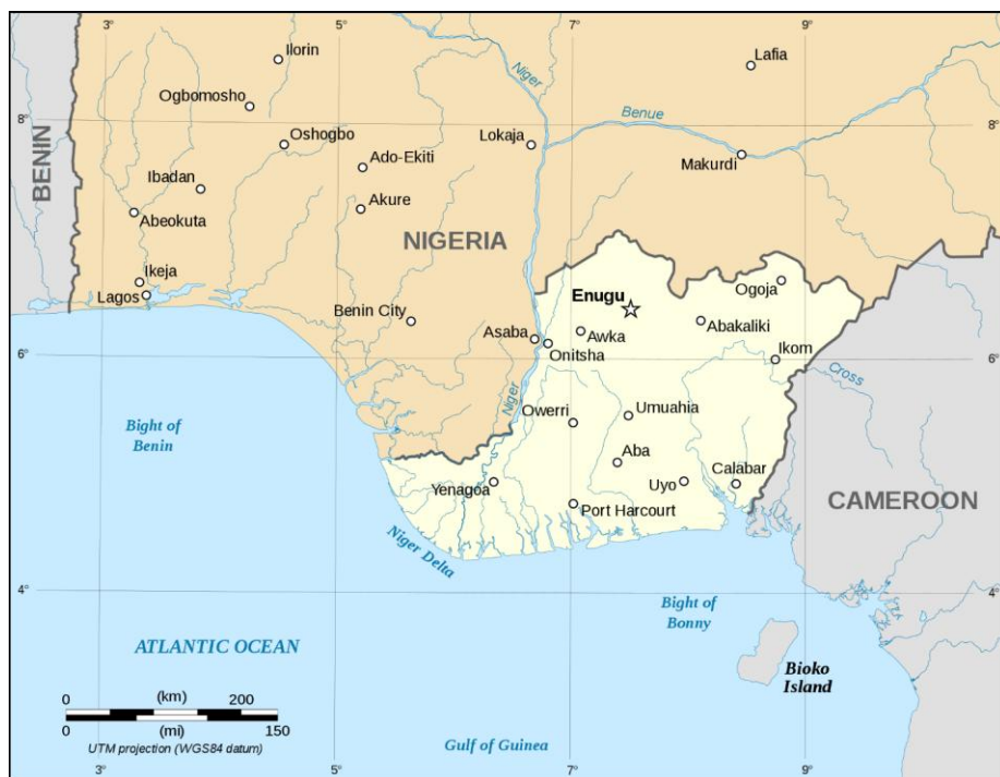
Figure 1: Political Map of Biafra Showing the Southern Seaboard. 23

strategic and operational weight: defending the coastline; conducting hydrographic surveys; training officers; and supporting customs and port enforcement. Between 1964 and 1967, further changes expanded the Federal Navy's Area of Responsibility. However, by far the most significant change to maritime law came during the military interregnum when the Gowon regime issued the Territorial Waters Decree of 1967. 21 Anticipating war and the need to blockade Biafra's southern seaboard (see Figure 1), this FMG Decree extended Nigeria's territorial waters from three to twelve nautical miles. The change was made possible through the FMG's amendment to section 18(1) of the 1964 Interpretation Act. 22