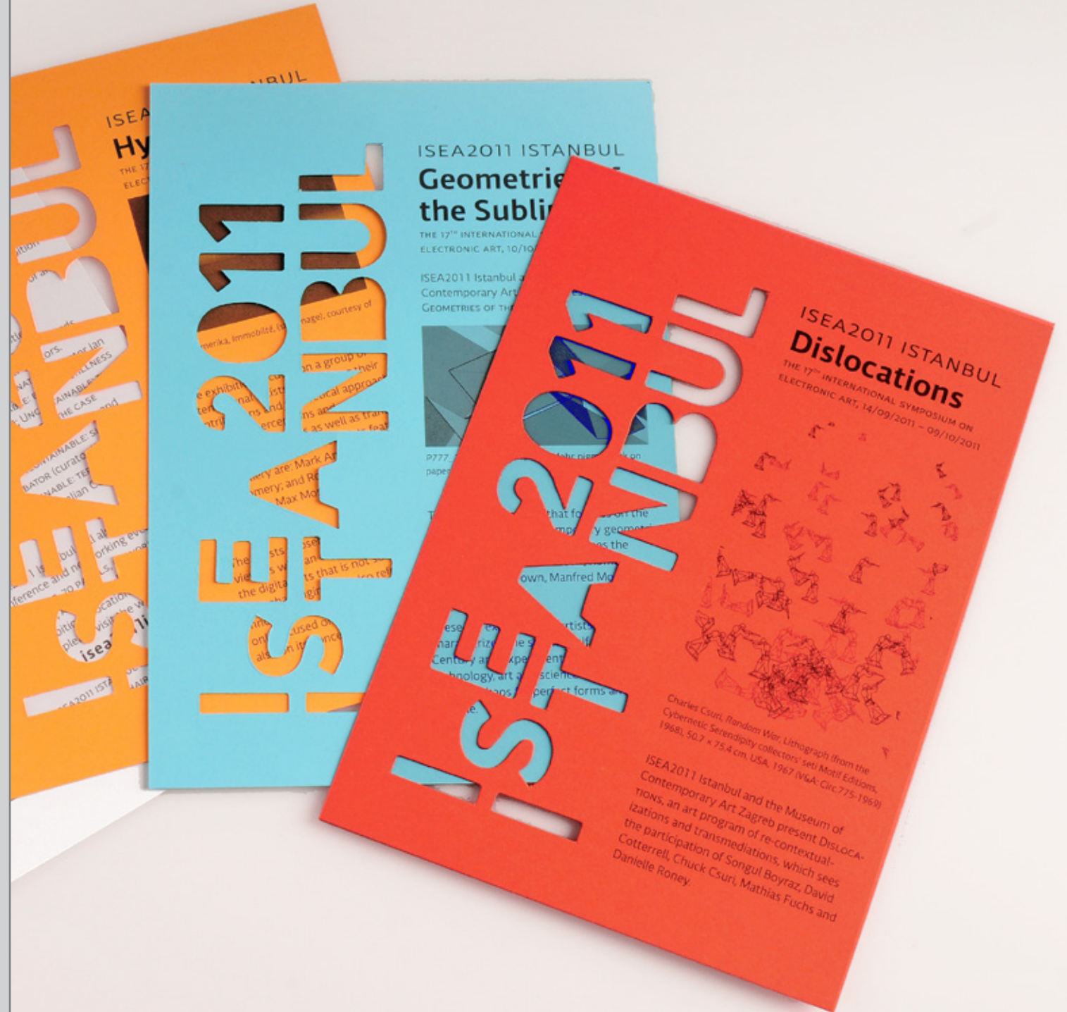
ISEA2011 DISLOCATIONS FLYER FOR THE 12TH ISTANBUL BIENNIAL PRESS PACKAGE