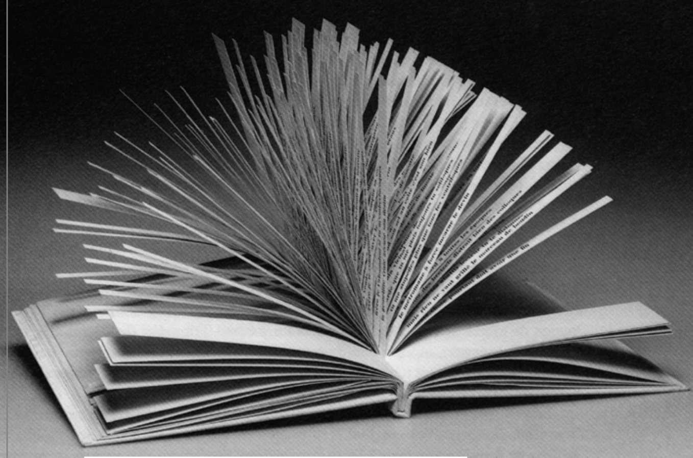
Figure 1. Massin's book design for Raymond Queneau's Hundred Thousand Billion Poems .

The title of this essay borrows from Raymond Queneau's iconic Hundred Thousand Billion Poems, a sonnet generator capable of producing 10<sup>14</sup> unique texts – a quantity that no one reader (or even a million readers) could parse in a lifetime. While Hundred Thousand Billion Poems gestures towards the impossibility of ever accessing the totality of its many reading paths, computer games such as Super Mario Bros. limit the player to one isolated, incomplete perspective among an enormous (but finite) set of possible playthroughs. Despite this single-player experience, collective patterns of play emerge from the repetitive, procedural, and discrete elements – what Ian Bogost calls "unit operations" – that drive computational media. Following Mary Flanagan's approach to game criticism and Jean-Paul Sartre's notion of seriality framed in terms of contemporary theories of network culture, this essay examines two categories