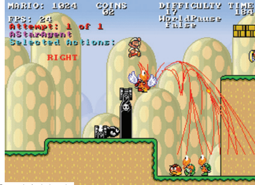
Figure 6. Screenshot of Robin Baumgarten's winning entry from Mario Al Competition 2009.

rendering experiments like mass AI implicitly invoke the serial conditions under which all games are played. The once-anomistic, individualized activities are collectively visualized.