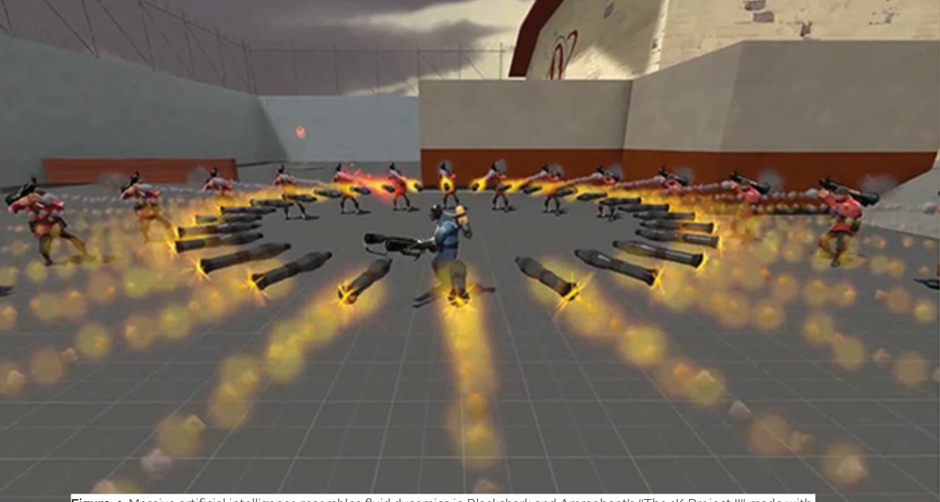
Figure 4. Massive artificial intelligence resembles fluid dynamics in Blackshark and Amraphent's "The 1K Project II" made with Trackmania (above) and reveals geometric patterns in the USK Clan's "USK Mass Bots" made with Team Fortress 2 (below)