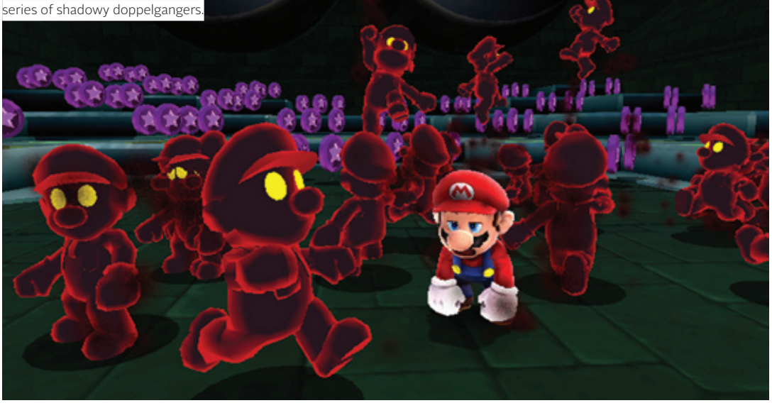
Figure 7. In Nintendo's Super Mario Galaxy 2 , the player must self-compete with a

and actual, has been incorporated into new forms of gameplay that figure button presses as probabilities within a much larger set of aggregate actions. For example, an emerging genre of self-cooperative gameplay involves recording a player's actions for a limited time and then simulates a multiplayer environment by replaying the combined actions of a limited number of previous playthroughs. These multiple recordings - or past lives - do not function simply as ghosts visualizing past plays but perform real-time actions necessary for further exploration of the game (e.g., holding a door open for future navigation). Selfcooperative gameplay was popularized by Cursor*10 by Yoshio Ishii of Nekogames and has proliferated in other Flash applications like A Good Hunch (2007-8), Timebot (2007), and Chronotron (2008) as well as in a games for more advanced platforms including Braid (2008), Onore no Shinzuru Michi wo Yuke (2009), Time Donkey (2009), Ratchet and Clank: A Crack in Time (2009), The Misadventures of P.B. Winterbottom (2010), and Ecoshift (2010). This kind of cumulative replay resembles the production techniques of audio engineering in which one musician or voice actor performs alongside multiple past recordings of herself. Most videogames have traditionally forced multiple playthroughs as either punishment for mistakes or to