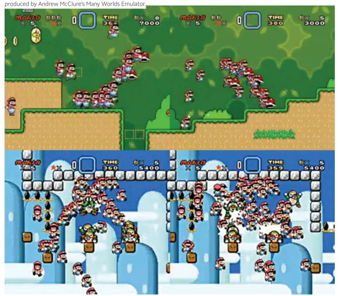
Figure 5. Composited playthroughs in Super Mario World (above) and Kaizo Mario World (below)

This interaction between multiple videogame franchises can be seen as part of a phenomenon Marc Steinberg has termed "new seriality." Whereas Sartre's model of seriality corresponded to mechanical and static forms of repetition and industrial production, the new seriality "corresponds to the informationcapitalist model" which "has no origin and proliferates through metamorphosis and translation." 24 Steinberg adds that this leads to "a mode of consumption which is itself serial: a character is consumed in its many object forms, as pieces of a constantly expanding universe." <sup>25</sup> Mario's branding follows this logic. Nintendo's mascot is an infinitely renewable resource whose potency lies not in scarcity, but through its multiplication and cross-pollination in numerous projects and media experiments. Integral to this process is not only Mario's transmediality, but also the interaction of this franchise with other franchises exemplified by works such as Super Mario Bros. Crossover. The mutations and transformations that occur by placing these series in relation to each other only further activates Mario's proliferation and brand power.