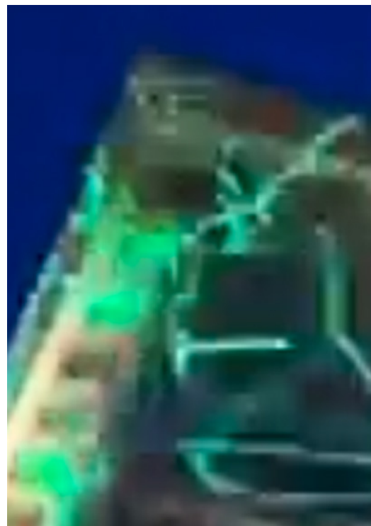
Figure 4. Enlargement of screen grab from Dance of the Lasers , laser light, stone, JPEG artefacts (from Laser Dance , Real Democracy Group, Athens.) Crop and enlargement by the author. Image by MindTheGap Citizens' Media / Real Democracy GR Multimedia Team. Used with permission via the Creative Commons Attribution-NonCommercial-NoDerivs 3.0 Unported License (artefacts and pixilation intentional).

in a space apparently distant from sites of action, an opposition is generated between those kinds of space where action is productive (the agora) and where action is not happening or does not happen (the library, the bookshop, in front of the screen.) Pourgouris refers to Žižek's opposition of objective to subjective violence – objective violence representing a kind of inaudible background noise which habit accustoms us not to hear. 23 Maybe reframing the object as