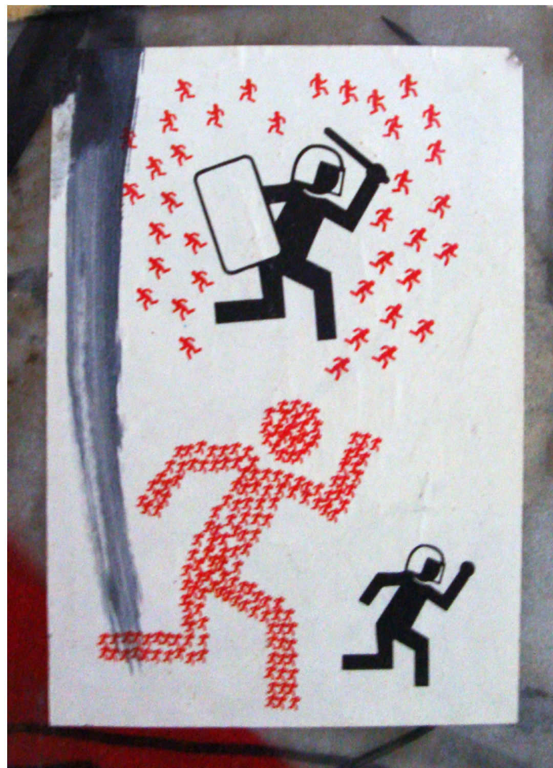
Figure 5 Protest posters, Athens, 2008. Collected in Ανησυχία , Kastaniotis Editions, Athens, 2009. Photograph by Efthimios Gourgouris. © Efthimios Gourgouris. Used with permission.

It is possible to view the display on the Hotel as a form of 'data visualization,' in the sense intended by Dave Colangelo & Patricio Davila in a previous edition of LEA. 32 However, the mechanism here is not produced, but autonomously generated. Yes, the buzzing lights truly represent 'a fluid, digital layer that perme-