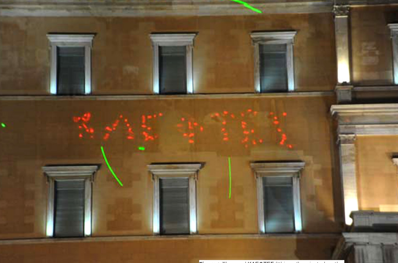
Figure 1. The word ΚΛΕΦΤΕΣ ('thieves') projected on the wall of the Greek Parliament building, Syntagma Square, July 22, 2011. MindTheGap Citizens' Media / Real Democracy GR Multimedia Team. Used with permission via the Creative Commons Attribution-NonCommercial-NoDerivs 3.0 Unported License (pixilation intentional).

word in red light: an accusation, the projection of an identity. The 'thieves' identified were, of course, days away from signing into law a package of austerity measures which would include the forced privatization of large parts of Greece's public sector – the transfer to private ownership of assets held in common – and cuts in benefits and tax rises. Previously, on May 5th, the taunt had been verbally slung against politicians in an abortive attempt to storm the building: here it was projected – turning the building into a curious kind of