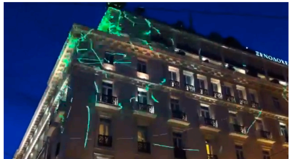
Figure 2. Screenshot from the video Laser Dance , Real Democracy Group, Athens (2009), MindTheGap Citizens’ Media / Real Democracy GR Multimedia Team. Used with permission via the Creative Commons Attribution-NonCommercial-NoDerivs 3.0 Unported License.

If the machine was not important to me at first, it was because I was engaged by the swarm of laser pointers trained on the architecture. The dots seemed an analogue of the crowd: stochastic, energetic, entropic.