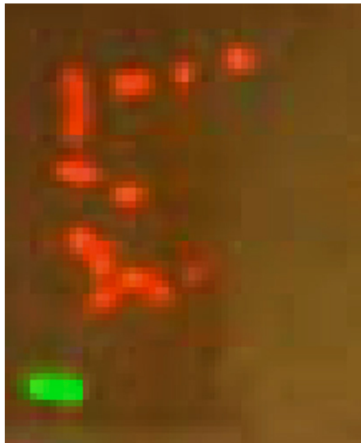
Figure 3. Thirteen points, and an interloper: the ‘E’ in ‘THIEVES,’ enlargement of figure 1. (pixilation intentional).

What proved the existence of a rig was the trace of mechanical reproduction. Across multiple images of the same event, the pattern of the word was replicated, almost identically, pixel mapped onto pixel almost perfectly, the only interruption being the irregularity of the projection surface.