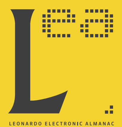
VOL 19 NO 4 VOLUME EDITORS LANFRANCO ACETI & DONNA LEISHMAN EDITORIAL MANAGERS SHEENA CALVERT & ÖZDEN ŞAHİN

What is the relationship between contemporary digital media and contemporary society? Is it possible to affirm that digital media are without sin and exist purely in a complex socio-political and economic context within which the users bring with them their ethical and cultural complexities? This issue, through a range of scholarly writings, analyzes the problems of ethics and sin within contemporary digital media frameworks.