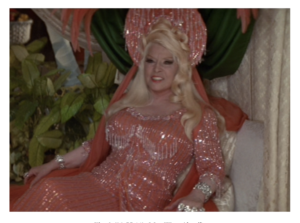
Fig. 3 (00:55:11): Mae West (detail).