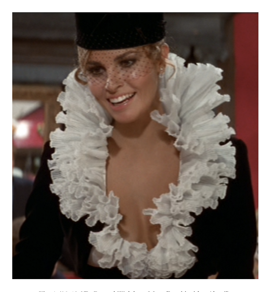
Fig. 1 (00:49:37): Raquel Welch as Myra Breckinridge (detail).

But Darling's rejection plays into a larger cultural tradition of trans women's representation, where the supposed symbolism of trans femininity obscures the actuality of trans lives.<sup>3</sup> The film and the novel that inspired it both participate in what Emma Heaney describes as the trans feminine allegory, where trans feminine figures are tasked with illuminating the functioning of cisgender sex. In her recent book, Heaney charts the emergence of the allegory in medical discourse around the fin de siècle, where it is portrayed as symptomatic of broader shifts and contestations in traditional gender roles.<sup>4</sup> The advent of the New Woman and the debased man are shadowed by the figure of the trans feminine invert who 'reveals' the androgyny and malleability of social codes, but also, ultimately, reinstates them. Sexologists such as Richard von Krafft-Ebing investigated the perceived social degradation of their times by extracting pathological case studies from gender and sexually non-conforming people, reasserting a new sexological norm in the face of the perverse, extreme example. The emphasis placed on narrative in these accounts