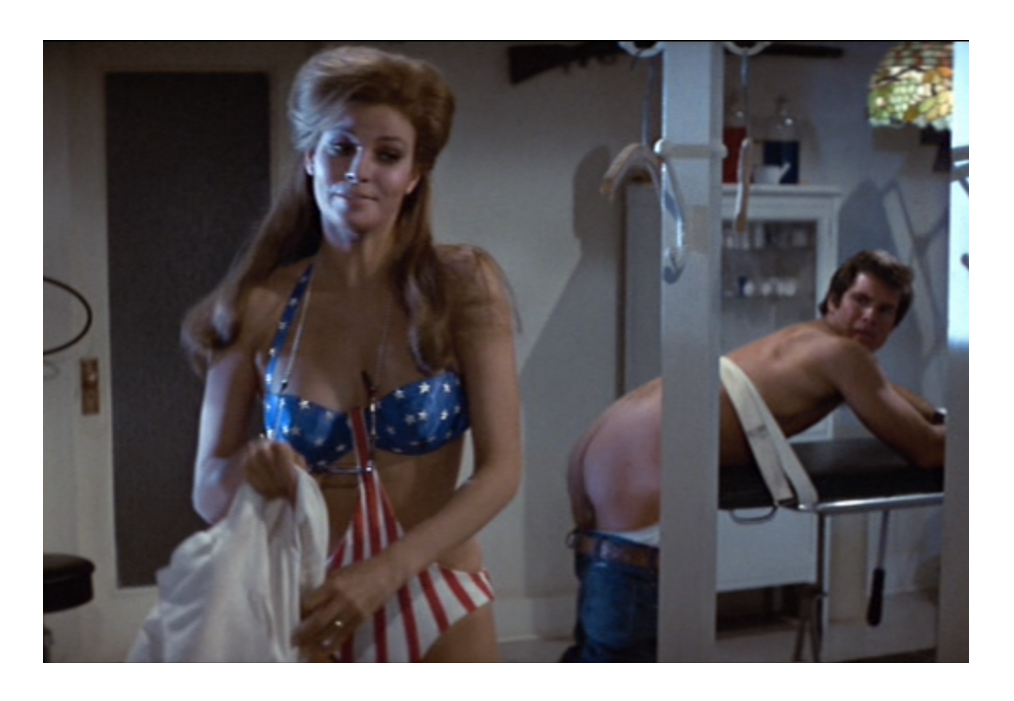
Fig. 4 (01:09:39): The notorious rape scene (detail).

bloody cults, with the great goddess herself for whom Attis unmanned himself [...] the eternal feminine made flesh' (pp. 156-57). The scene is the culmination point of the various discourses operating in the novel, parodying the medical examination of trans people on the operating table and 'opening up' the immobilized alpha male for medical inspection. Myra's raptures also force a decadent alignment of the world of classical debauchery with the present moment, her reference to the self-castrating Greek deity Attis providing a possible echo of Wilde's 'The Sphinx' (1894): 'Atys with his blood-stained knife were better than the thing I am'. 41 Myra is the meeting point of these discourses held in allegory: though her actions parody the medicalization of gender variance, the scene is equally an examination of the depth of her perversion, centrally orientated around her castrated genitals, here reinstated by the stereotypical feminist weapon of a strap-on dildo. In the film, this scene was enacted with Welch in a stars-and-stripes leotard and cowboy hat, explicating the decadent social critique at play [fig. 4].