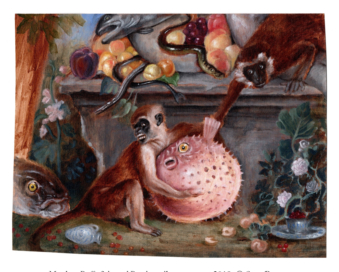
Monkey, Pufferfish, and Peaches, oil on canvas, 2019