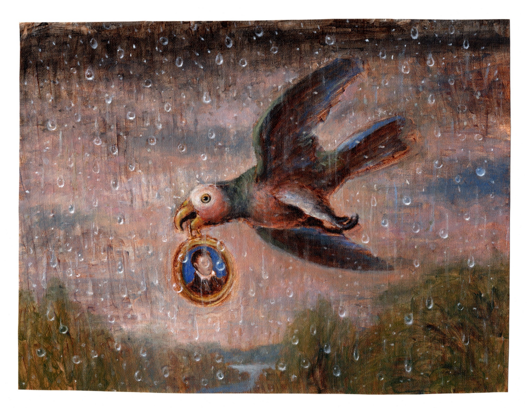
Bird with Miniature, oil on canvas, 2020, © Sam Branton