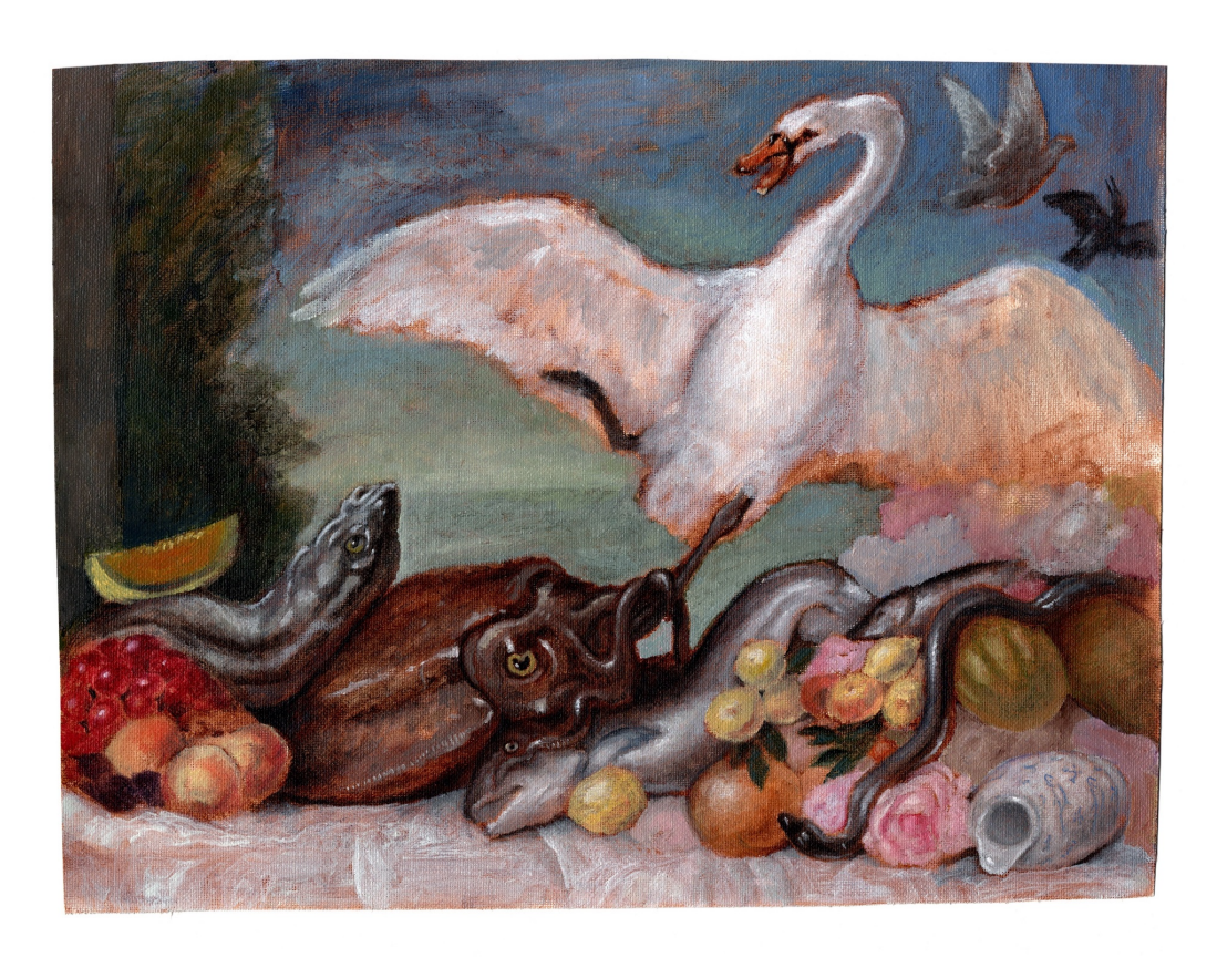
Swan, Squid, and Lemons, oil on canvas, 2019