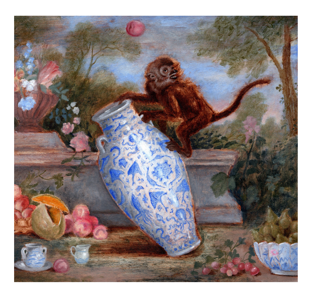
Monkey with Large Vessel, oil on canvas, 2019