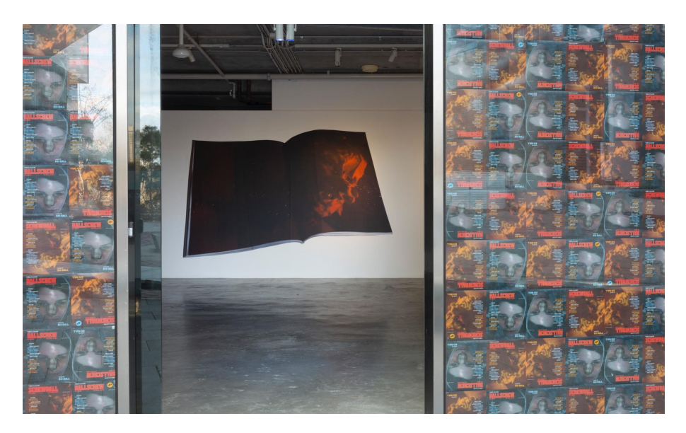
Fig. 1: Screwball (2022), exhibition documentation by Jek Maurer.