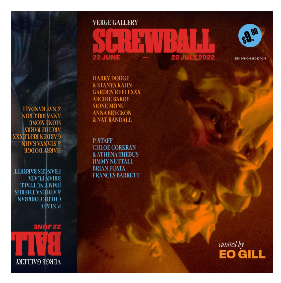
Fig. 10: Screwball catalogue cover, design by Ella Sutherland (2022).

conventionally left unseen or discarded in the editing process of selection, Piece of Work emphasizes the impact of the affective nuances of performance on storytelling, rhythm and form. The loop structure is a familiar device for Breckon and Randall, who also employ the technique in their live mediated theatre works The Second Woman (2016) and Set Piece (2021). Breckon has described the looping iterations as a kind of 'edging', by resisting a climactic narrative structure. Instead, the repetition of the piece moves the viewer through a series of anti-climaxes.<sup>18</sup>