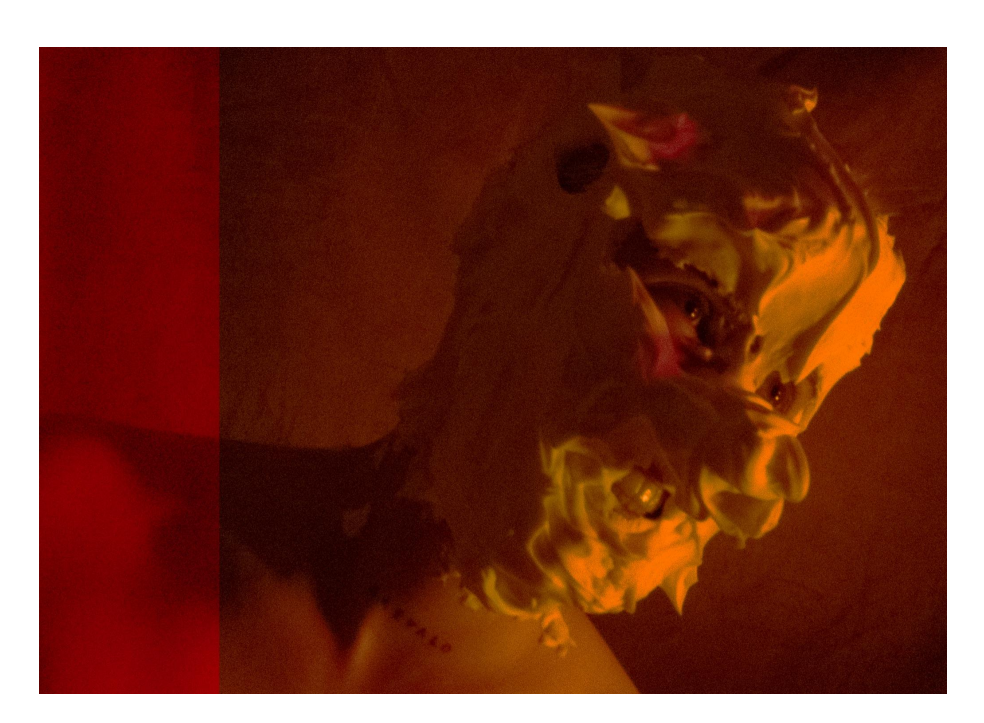
Fig. 5: Athena Thebus and Chloe Corkran, In Dramatic Roles Such As These (2022).

playfully hints at broader questions around transgender desire and becoming and mocks tired transgender narratives of failure and lack.