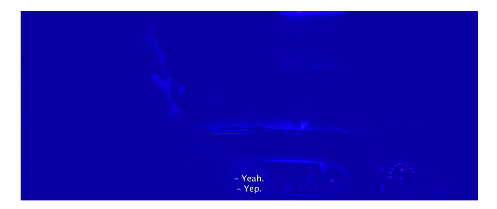
Fig. 7: Video still from Garden Reflexxx, Blue Car (2022).

The low-fi Screwball video work Blue Car (2022) by Garden Reflexxx (Jen Atherton and André Shannon) is one such piece. The 10-minute piece documents two friends, Gloria (Gloria Bose) and Bart (Shannon), on a road trip engaging in banal conversation as Atherton captures the interaction from the back seat with their phone camera. Annoyingly, the car's faulty interior light will not turn off and so Gloria addresses the issue by producing a small bottle of Prussian Blue nail polish from their bag and gradually paints over the light. The stark lighting in the beginning of the film gradually shifts into a saturated blue hue (see fig. 7).