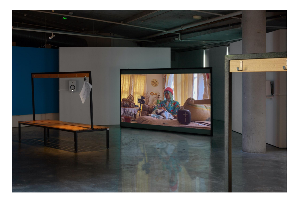
Fig. 3: Screwball (2022), exhibition documentation by Jek Maurer.

In a review of Screwball , Veronica Tello notes that the show strategically and powerfully responded to the current hyper-visibility of gender and sexuality discourse in art institutions, both in Australia and around the world.<sup>2</sup> Tello remarks that this drive to hyper-visibility emerges as art institutions scramble to ensure their relevance and futurity by 'diversifying, decolonising, and queering' their collections and initiatives.<sup>3</sup> At its worst, this impulse to 'heed the demands of contemporaneity'<sup>4</sup> favours images of positivity and progress, catering to the 'dark side' of modern queer representation and disavowing the link between queerness and loss.<sup>5</sup> Where some might perceive the unabashed celebration of queer identity and image as being in line with the decadent tradition, my view is that decadence is as much about evasion, disappearing and trickery as it is about excess, pleasure and indulgence.