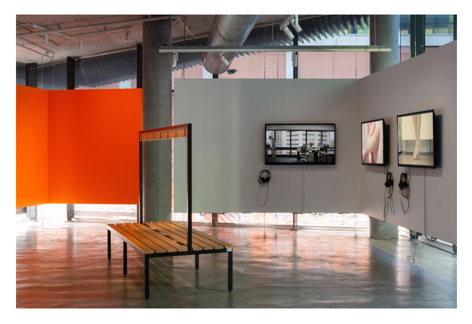
Fig. 2: Screwball (2022), exhibition documentation by Jek Maurer.