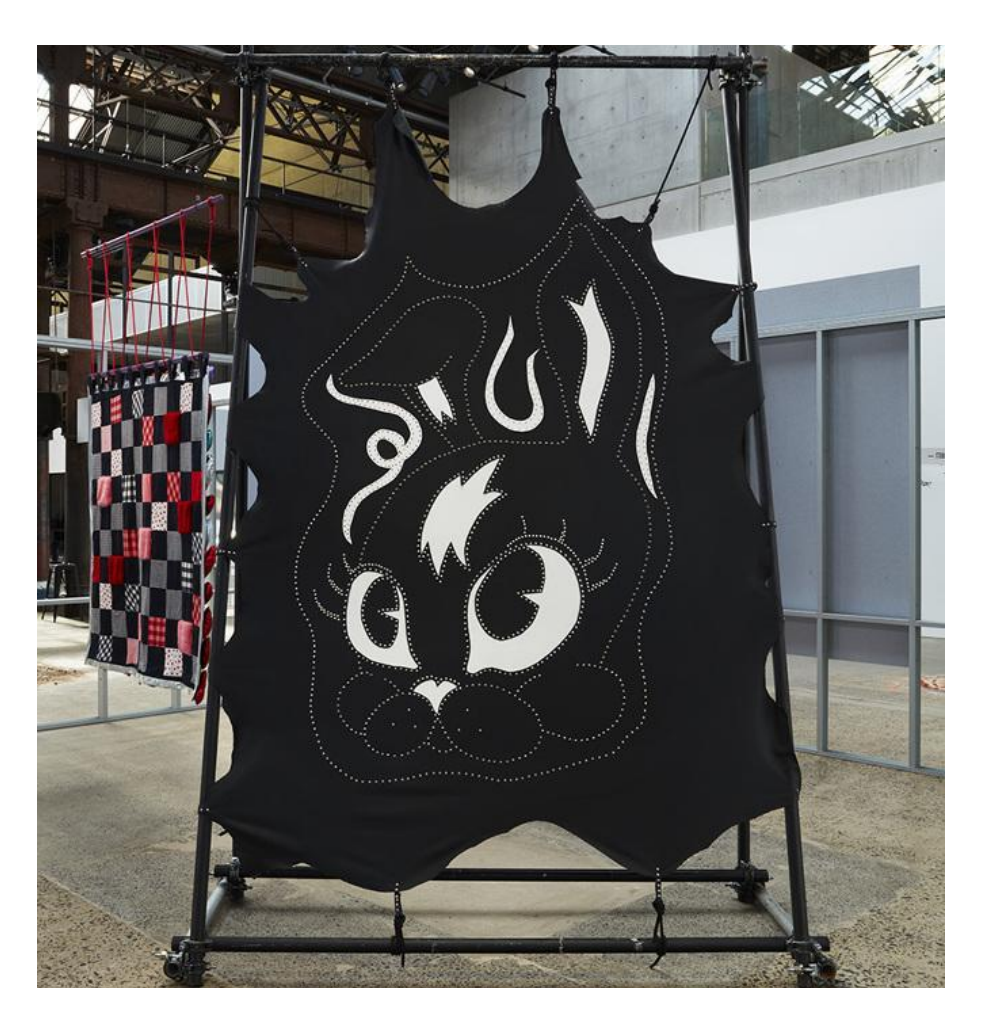
Fig. 6: Athena Thebus and Chloe Corkran, Bunny (2021).

Not all the artists in Screwball draw on Looney Tunes characterization. While the Screwball can attach to a character or behaviour that is odd or 'off', and so something to be laughed at, as with Bugs Bunny and Elmer Fudd, it is also registered as a navigational tool or methodology, a screwballing of convention that engages the obscene. Taken as a verb, screwballing is a way of toying with the filmic conventions that guide us in how and where we look. Screwballing means to make the camera an explicit element of the plot. It draws our attention to visual mechanics while paradoxically immersing the viewer in the 'authenticity' of the depicted action, as with Dodge and Kahn's 'motivated camera'. This screwy way of making work isn't about planning illusionary worlds: it is about the action of living. A way of passing time, the screwball engages relational, non-normative forms of sensuality, pleasure, and connection. Unlike narrative-driven forms, the