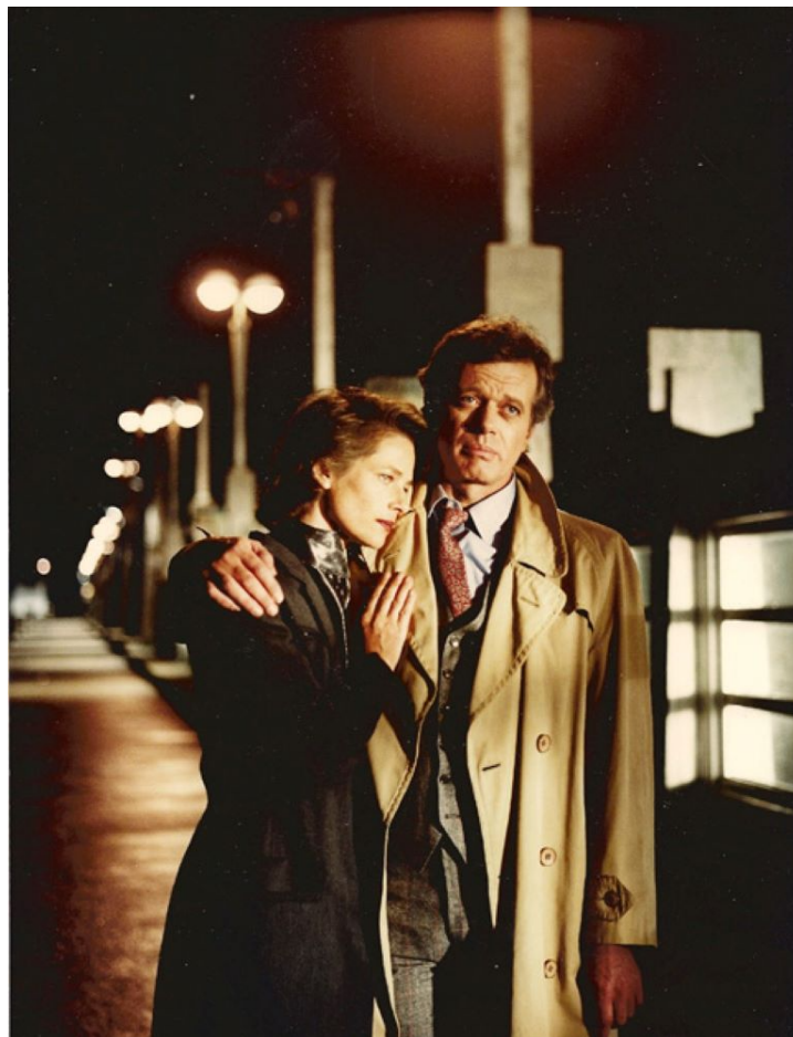
Fig. 1 (00:56:58): Charlotte Rampling as Gaby and Michael Sarrazin as Bert.