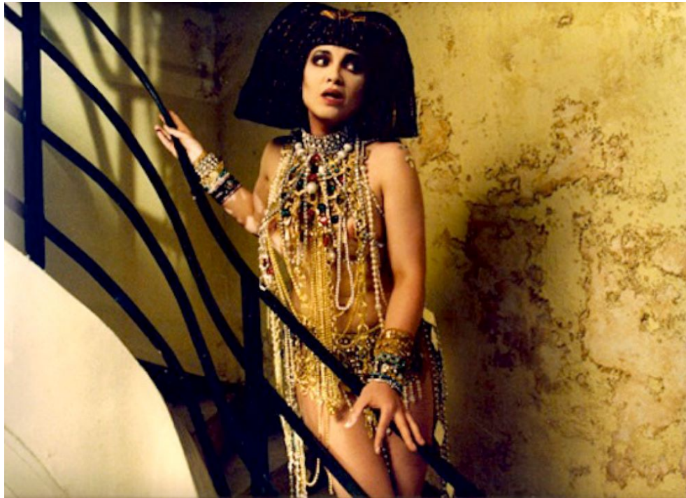
Fig. 5 (00:37:28): Salome.

sadomasochistic libido, killing anyone who challenges his fragile self-image or his rigidly defined boundaries of gender identity.