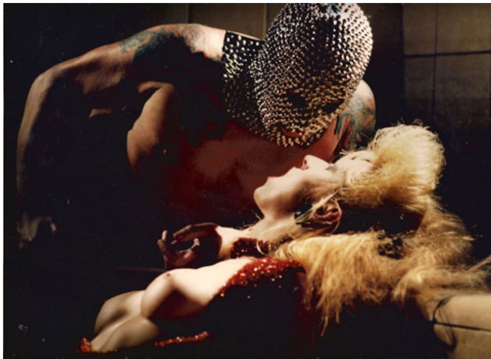
Fig. 3 (00:29:45): Mister Butterfly.